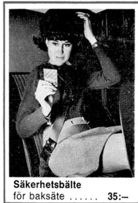
From the 1969 accessories catalogue

Use the index finger to feel and find the fitting on the C-column behind the roof vinyl. It is located in the middle, approximately 2" (5 cm) above the back support of the back seat. The delicate problem with retractable seat belts in the back seat is the fact that there is a fourth fitting needed for the reel itself. There is no such fitting. Some choose to weld these fittings (one for each side) in the metal under the rear shelf. Besides proper welding training, this requires both that the reel allow the belt to run also when lying down and that a supporting sheet of metal is welded under the rear shelf (or the car will not pass the mandatory inspection that many countries have).